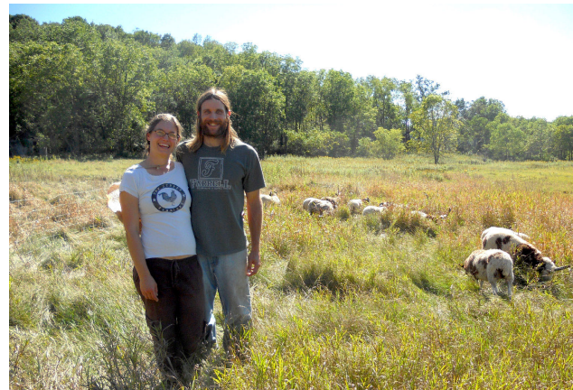
Ducks in a Row Family Farm, Arena, Wisconsin

Veterinary technicians are often the first face that clients see or the first voice they hear on the phone when they call for animal health information, or for emergencies. Communication that is clear, considerate, and sympathetic to the client's wishes and feelings is invaluable to maintaining a professional, welcoming and trusting atmosphere. Other animal health professionals such as extension specialists have the unique opportunity to develop lasting relationships with clients through good communication. The success of agricultural programs often depends on the ability of an extension specialist to communicate and coordinate with producers, veterinarians, and other extension personnel. Clarity and conciseness of a message are key. No matter the role, clear communication is key to successfully working with any type of producer, including those who raise organic and alternative livestock.